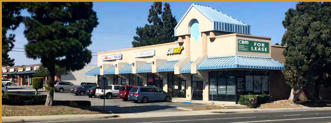
END-CAP SPACE AT BUSY TORRANCE INTERSECTION